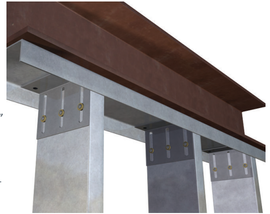
US Patents #5,467,566 & #5,906,080